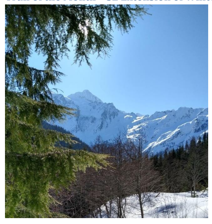
1) View of Mt. Shuksan from the SE Extension overlook

This is the winter to spend time in our local winter-wonderland! Members of NNSC have been putting in efforts to make our trails more accessible and user friendly. My goal is to make tracks on every one of them this winter!