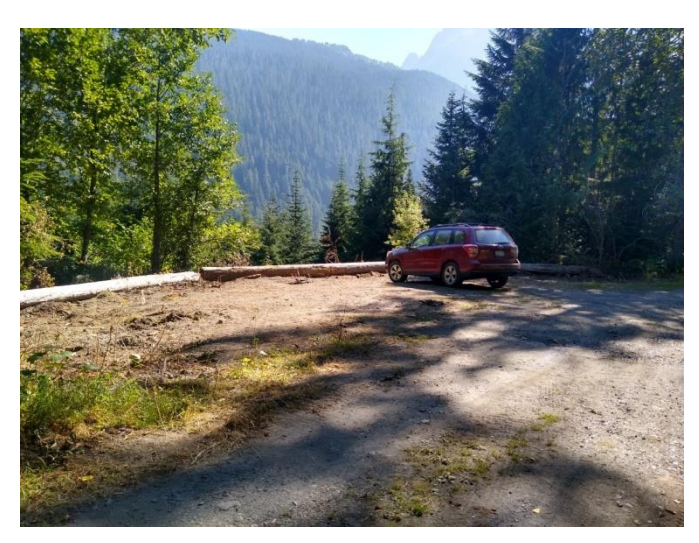
2) Overlook near end of SE Extension

quite quickly. Or park at the 'Switchback' and hike the rest.