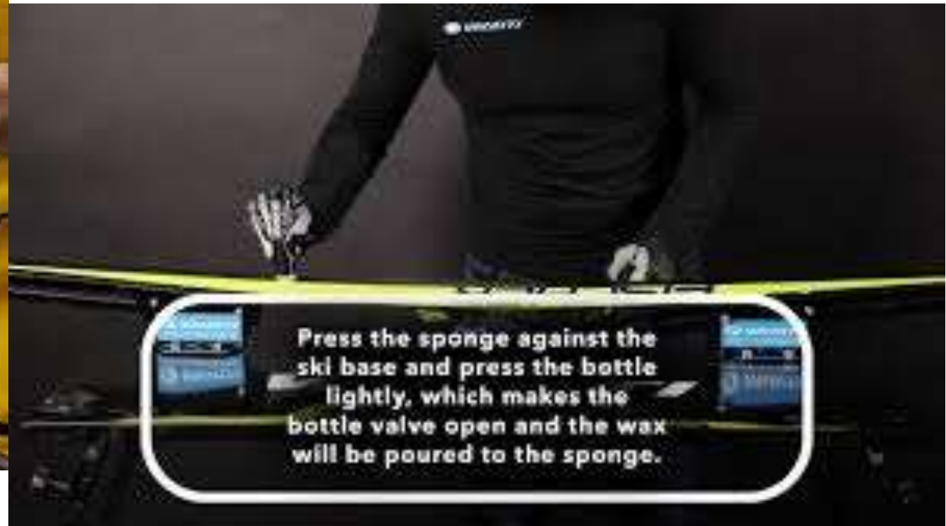
New School – not just for the lazy anymore