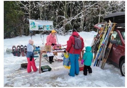
NORDIC AMBASSADORS - 2022