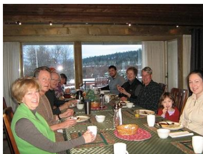
Breakfast at Stake Lake 2015

Do you want more current snow conditions than a monthly newsletter? Check out your club's web page or sign up for a Mt. Baker snow forecast page at http://www.snow-forecast.com/resorts/Mount-Baker .