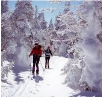
Nickle Plate 2014