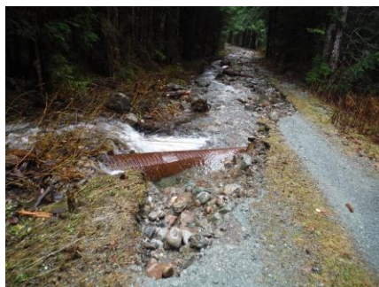
Anderson Creek Road