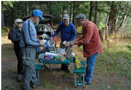
Brush Clearing Volunteers Having Lunch