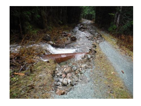
Anderson Creek Road