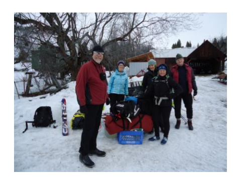
Skiing at Rendezvous

the rock wall near Cost Cutter at 8am for carpooling. We usually try to return to B'ham by early evening (6-ish). Remember to bring your PASSPORTS or other acceptable identification for re-entering the USA.