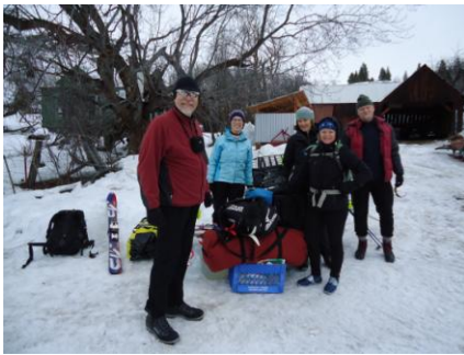
Skiing at Rendezvous

photo of the rest of the members going off on their moonlight ski. When they returned, they were in high spirits. It had been a clear night with a full moon to illuminate the snow-covered landscape. I would be sorry I hadn't gone, as the next two nights hosted clouds which decreased the light and no one went skiing.