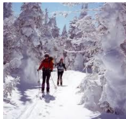
Nickle Plate 2014

Bedding and linens are supplied with BASIC dishes and cutlery, a small microwave, coffee pot, and some cooking utensils.