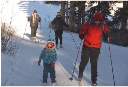
The Rhodes Family at Logan Lake